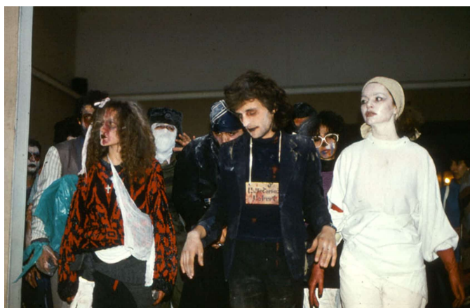
Figure 5. The 3rd Floor. (1988). "The Official Art Has Died- Hail to the Union of Artists from the Netherworld" exhibition

The performance sentenced outdated official art to metaphorical death, negating the Socialist Realist institution of art which was “bureaucratic, whose values were determined by a state-invented standard of mastery, not even academic mastery, but on anti-Western false thesis” (Arman, personal communication, April 21, 2024).