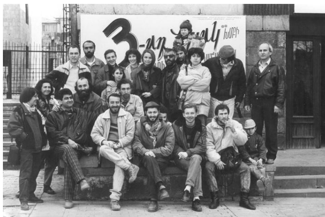
Figure 2. Members of the "3rd Floor" at the opening of the "Graffiti" exhibition, 1992