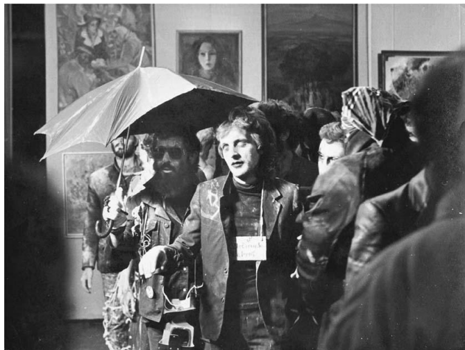
Figure 4. The 3rd Floor. (1988). "The Official Art Has Died- Hail to the Union of Artists from the Netherworld" exhibition

regime) walked silently through the exhibition. After viewing the works, the ghostly procession left the show (Azatyan, 2008, p. 44).