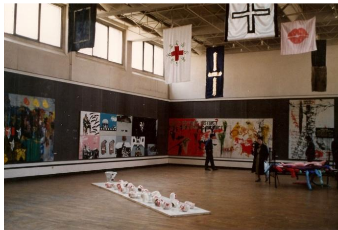
Figure 3. Araqelyan, K. (1990). The 3rd Floor "Plus Minus" exhibition

The group embraced the idea of all-inclusive, free creativity and aimed at direct engagement with the public by incorporating Western signs and symbols (Robertson & Karoyan, 2022). Among such symbols were musical icons they associated with absolute freedom and creativity, such as the heavy metal band Black Sabbath.